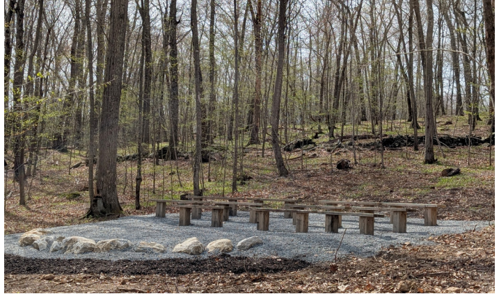
The Bulkeley Hill Preserve's outdoor classroom, Colchester Land Trust