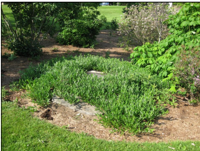
Prunus pumila var. depressa