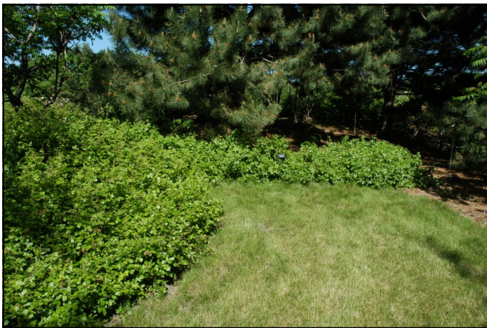
Rhus aromatica 'Gro-low'