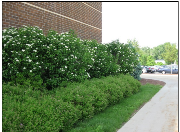
Above: Viburnum dentatum