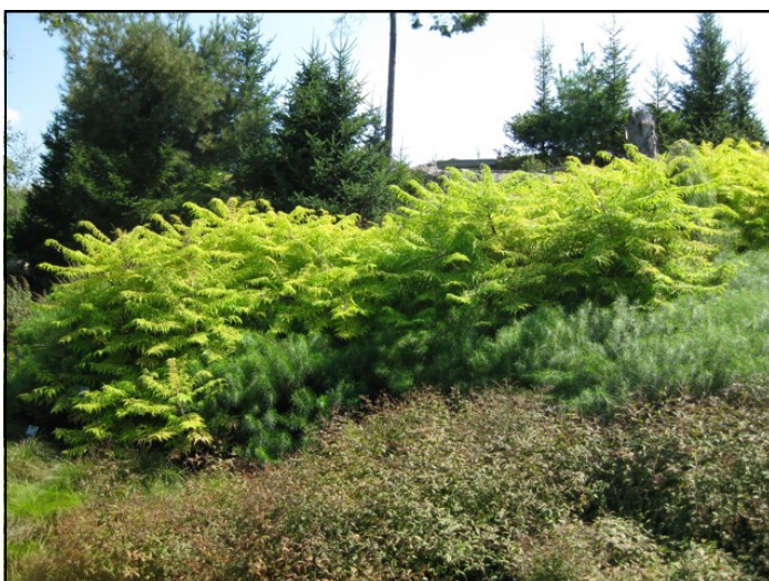
Rhus typhina 'Tiger Eyes'