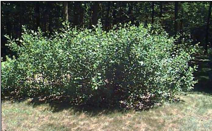
Above and below: Aronia melanocarpa