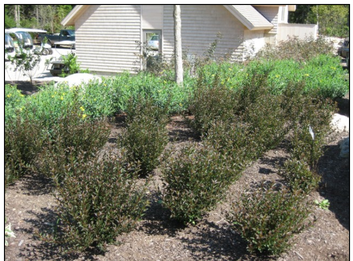
Physocarpus opulifolius 'Donna May'