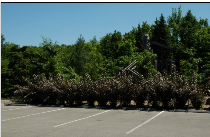
Left: Physocarpus opulifolius Diablo®