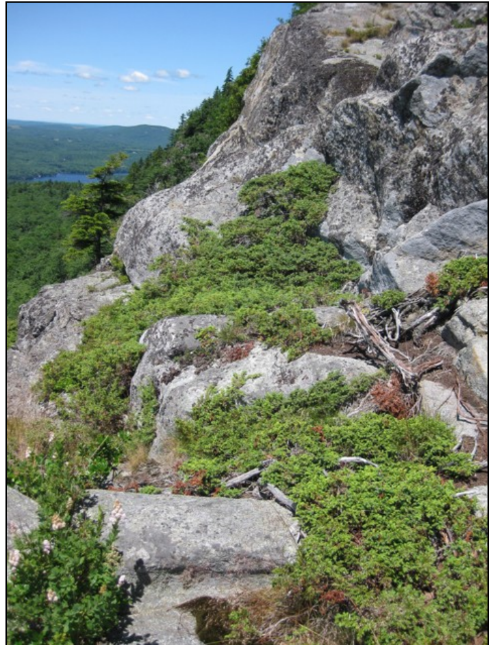
Wild Juniperus communis and Spiraea latifolia atop Mt. Megunticook, Maine.