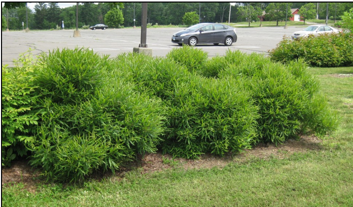
Above: Comptonia peregrina Below: Aronia arbutifolia