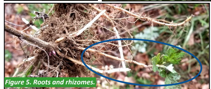
Figure 5. Roots and rhizomes.

Figures 1-3 and 5-6 by Alyssa Siegel-Miles; Figure 4 by Radio Tonreg, North Carolina Extension.