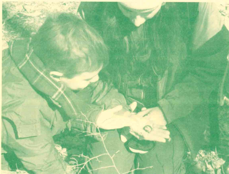
From one generation to another.

Spring is on its way and wildlife in addition to amphibians make their home on all of Avalonia's properties. Do enjoy spending time outdoors with your children, grandchildren, and friends on all our Avalonia properties, exploring our local natural environments, taking pictures, bird watching, and hiking our trails; but please leave only footprints.