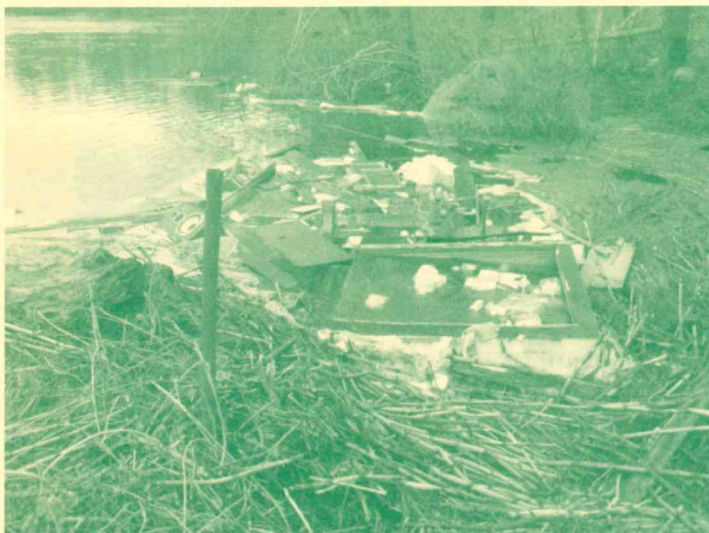
Sluice entrance of the Parke Memorial dam filled with debris immediately after the flood and before clean-up began.