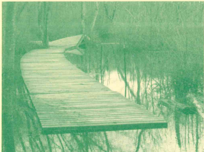
The Henne Tract boardwalk rises to the occasion during March flooding.

We regret that in order to reduce our operating costs we may have to discontinue mailing of this newsletter to members not current with their dues. Please check your membership expiration date in the top right hand corner of your mailing label. For your convenience, there is a membership renewal form on page 6.