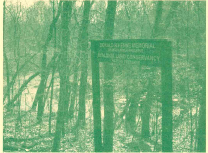
Sign at the entrance to the Henne Preserve, which is located on the south side of Babcock Road in North Stonington.

Preparation for constructing the walkway has been extensive. A cut and fill section was hand dug and buttressed with cedar logs cut from the Avalonia Moore Woodlands in Groton. The grade is shallow enough for horses and runs along the side of what Anne Nalwalk suspects is a glacial esker. About thirty cedar logs have been hauled in to the site of the walkway to form the "corduroy road" base. Pressure-treated 4"x6" timbers are being purchased to complete the walkway structure. This early work has been done by the usual gang of stewards. It is hoped that a larger crew of volunteers can be assembled to complete the carpentry portion of the walkway construction. There is talk of draft horses being used to haul in material. Work may continue in December and January. If you would like to participate or even if you would just like to come by and take pictures, please contact Mac Turner (535-1541).