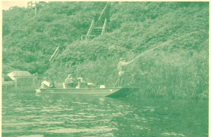
Herbicide spraying by CT DEP personnel at Poquetanuck Cove, September 2008.

Eradication Update by Anne Roberts-Pierson